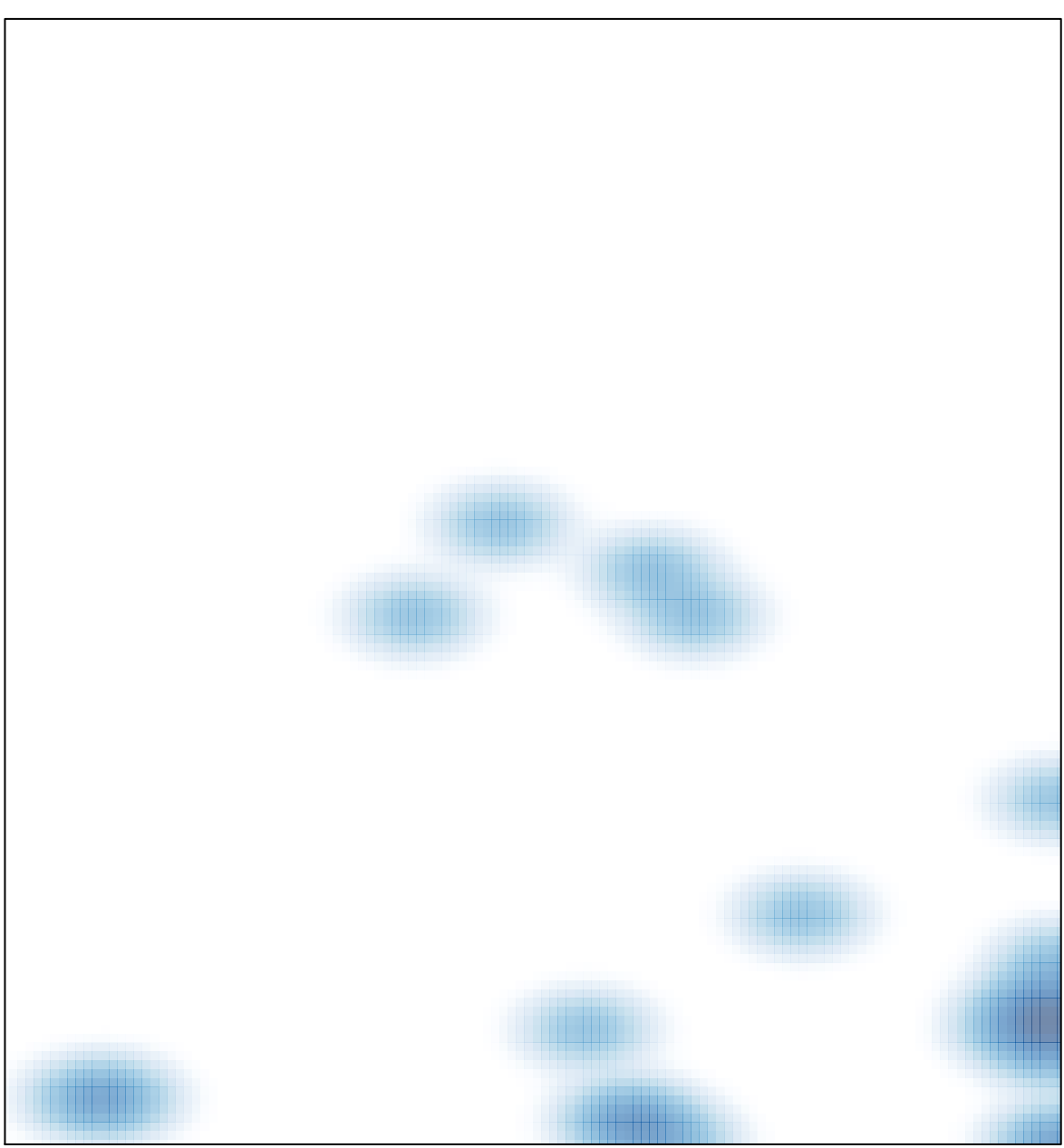
# features = 20 , max = 2